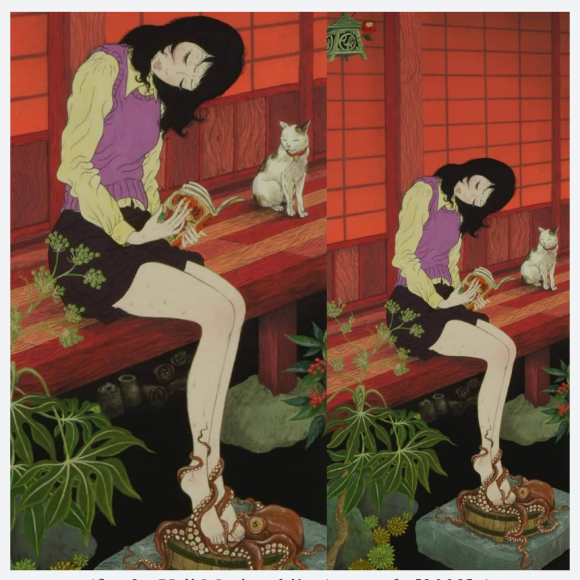
(fig. 3 - Yuji Moriguchi's A veranda [2003].)

Nanamica Revision / Lemegeton Lovers in particular was inspired by the Japanese shunga (portrait of spring). Yuji Moriguchi basically nails my ideal reading experience by drawing on that tradition in a contemporary way: