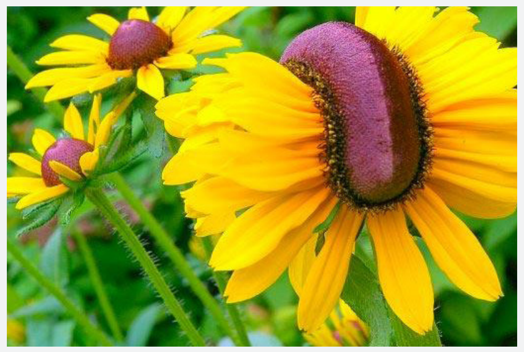
(fig. 4 - Fasciation in action.)