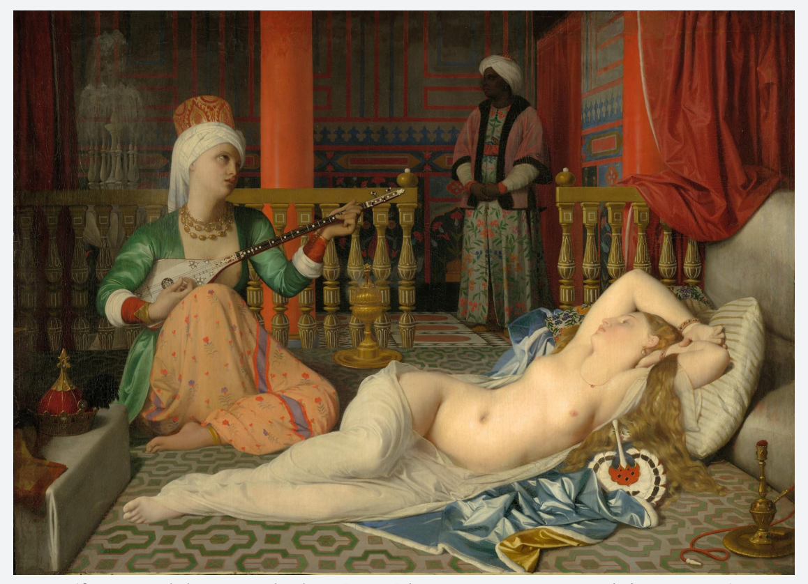
(fig. 2 - Odalisque with Slave [1839] by Jean-Auguste-Dominique Ingres)

But to briefly recap: the realm of Barthean textual Pleasure belongs to the Musician (which denotes an ease of access & semiotic literary familiarity via something that reminds you of language's prime function, which is to communicate, stimulate thought, & even entertain through individual expression of long given codes & tropes).