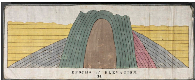
by Orra White Hitchcock (1828–1840)

The Future Archive Institute is one of four glass buildings looming over the oceanside city. On a lower floor, in the processing department, Kiera pulls a lollipop out of a pocket in her grey uniform and looks around at her coworkers. They are dressed in the same drab, department issue coveralls. Next to her, flakes of earwax fall from Herbert's ears into a tiny pile on his shoulder. She collects another package from the pallet near the door and sets it on the table. From inside, she lifts out a large glass jar that looks like a small aquarium. Herbert glances up at the unusual container. The water seems to be tinted green, and attached to the jar is what looks like a small oxygen filter. A few rounded stones and some billowing algae sit atop a layer of white pebbles at the bottom. She looks again at the information slip. Cephalopod . In the jar she sees a brownish lump between the algae that she guesses is a camouflaged octopus.